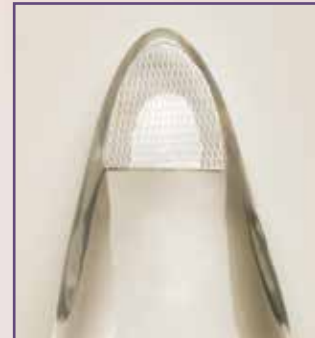
Pocket easing insertion

Our calf implants are sold sterile, single-use, by unit.